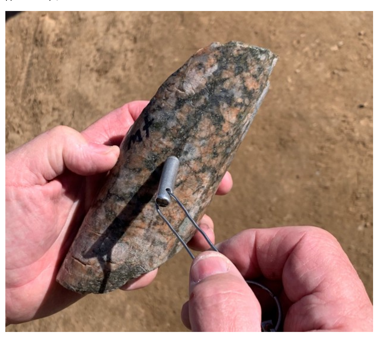
Figure 2*: Hydrothermal magnetite with chalcopyrite-pyrite and pervasive potassic alteration at approximately1,032 metres.