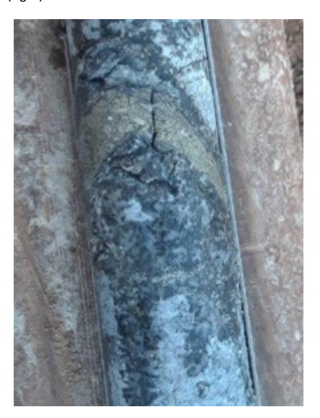
Figure 1*: Significant chalcopyrite veins encountered at approximately 814 metres (left) and 822 metres (right).

K-20 is believed to be located at the edge of the porphyry copper system, as indicated by a deep resistivity low located by a Magneto-Telluric ("MT") survey completed by a previous joint venture partner with Bell Copper in 2017. Deepening the hole may be able to explain the source of the low resistivity anomaly that appears to lie below and to the SE of the current bottom of K-20.