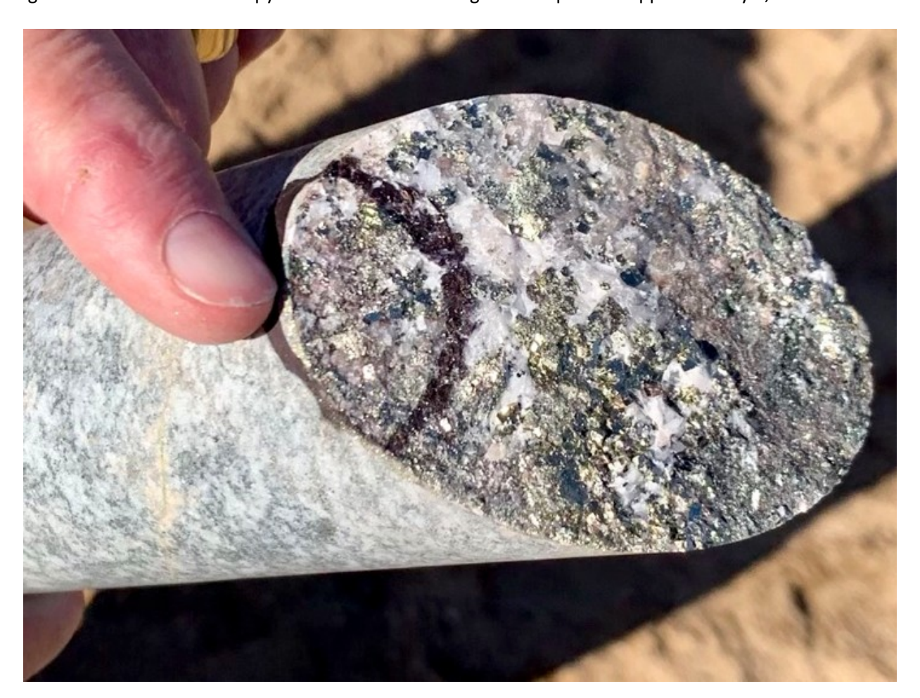
Figure 3*: Bornite and chalcopyrite mineralization along fracture plane at approximately 1,020 metres.